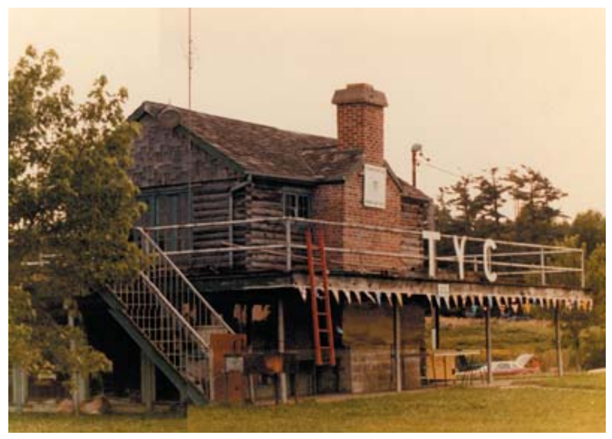
How Many Remember This Club House?

Please keep in mind that the work hours program is completed for the 2007 season. I appreciate everyone "doing their time" this year. Again, this program works and it is a large part of the reason why the facilities look the way they do. You may track your hours on line at the club's web site.