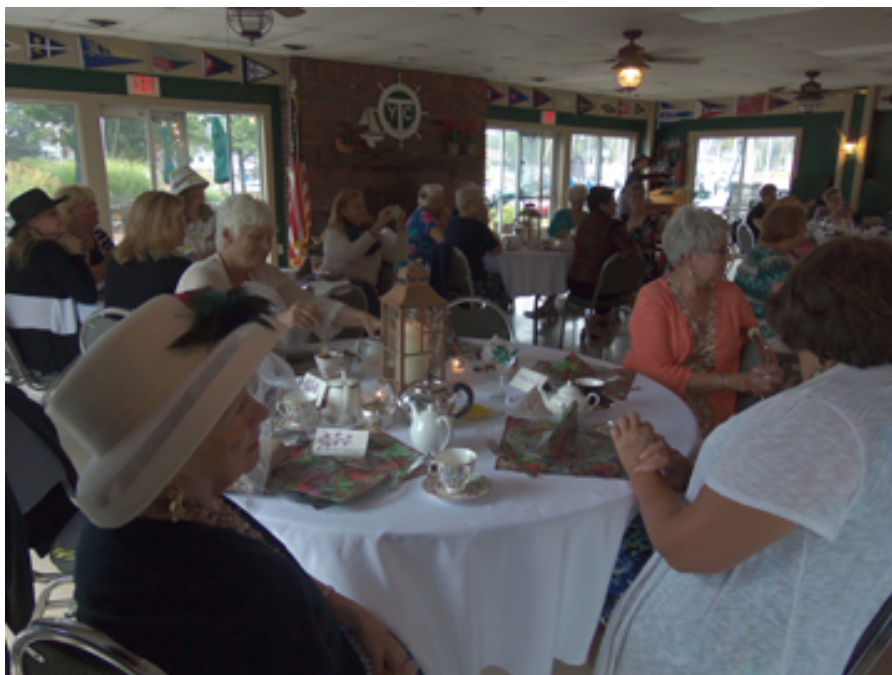
Commodore's Tea, 2015