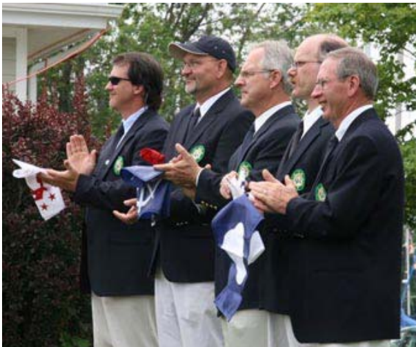
Doesn't Sail Past seem like yesterday?